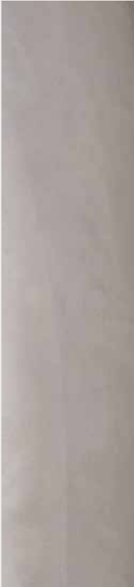
Concrete Look Render Paint