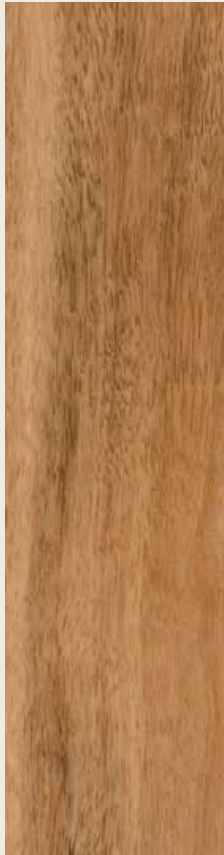
Timber Laminate - Tuscan Oak