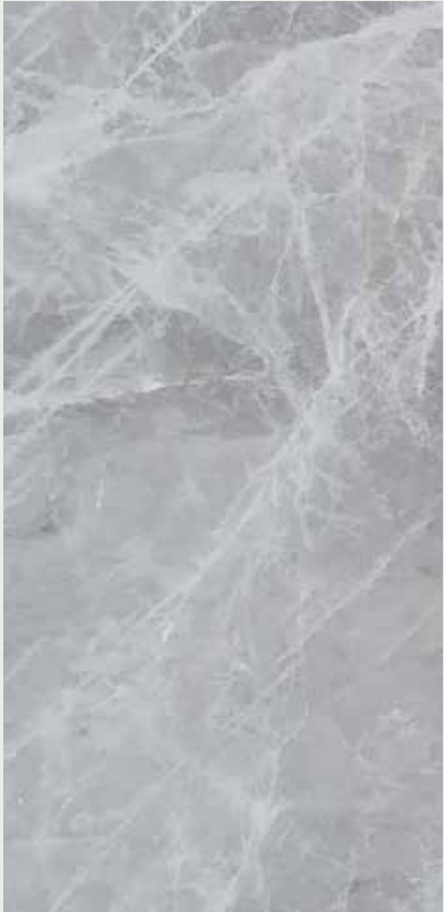
Natural Stone - Desert Silver