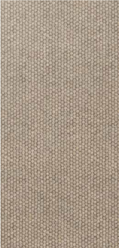
Loop Pile Carpet