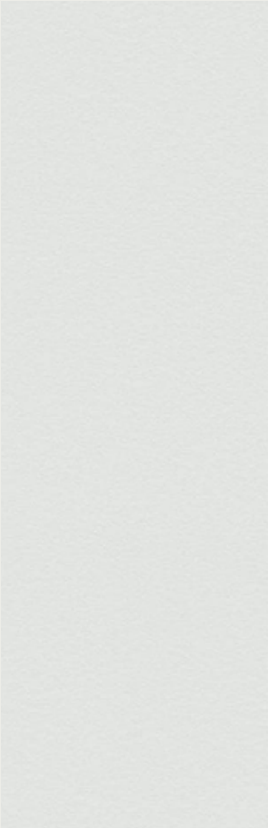
Laminate - Sarsen grey