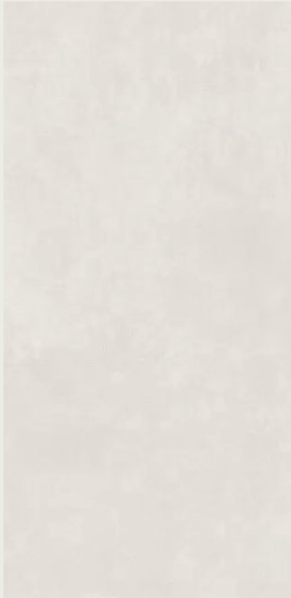
Porcelain Panel - Calce/Bianco