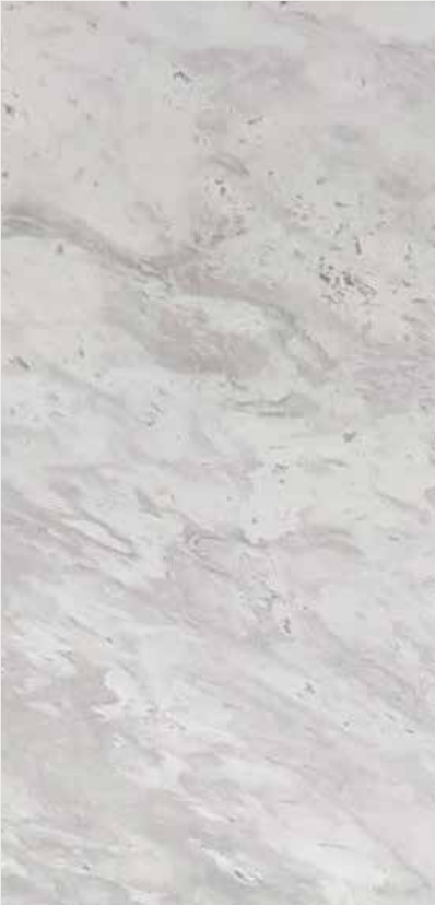
Natural Stone - Ilva Blue