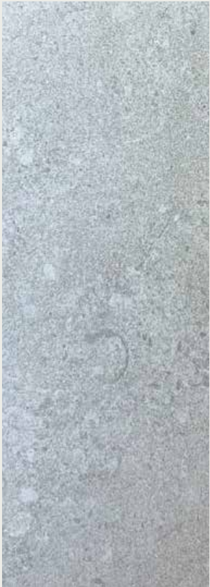
Floor & Wall Tile