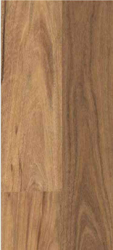
Engineered Timber Flooring - Spotted Gum