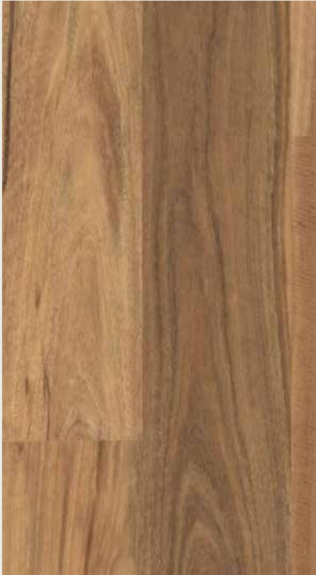
Engineered Timber Flooring - Spotted Gum