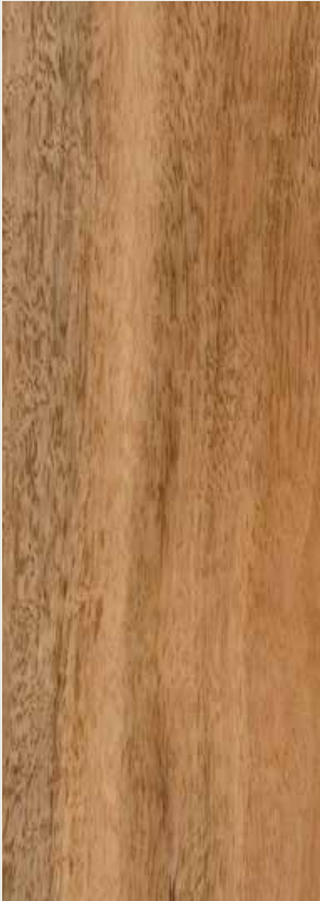
Timber Laminate - Tuscan Oak