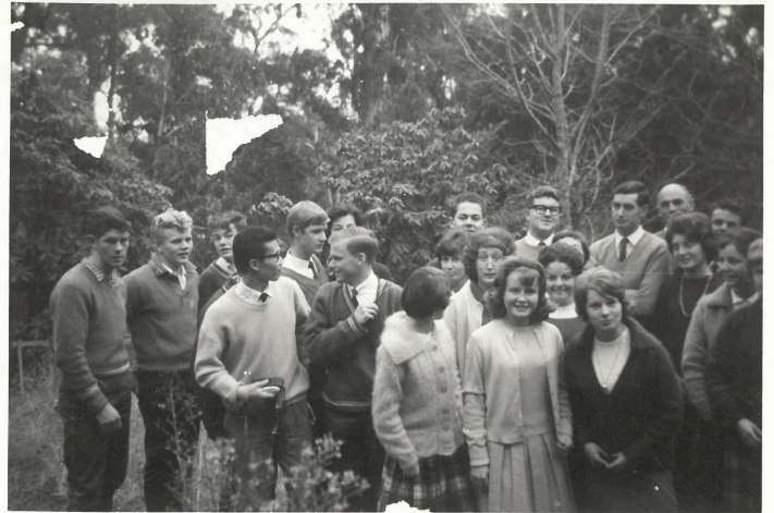
The first Youth Camp c1960's

The faithfulness and generosity of the people who host this camp annually, providing food, activities and a beautiful location for us to gather; the faithfulness and dedication of my youth leaders, who invested deeply in my life and nurtured my faith, enabling me to now serve in that same capacity for the next generation of youth; the faithfulness of the parents, who encourage their children to pursue Jesus, and entrust them into our care to love, support and journey with them through such formative years. This weekend hosted a deeply impactful moment in my journey at NewHope. A moment where a collection of Sacred Memories arose.