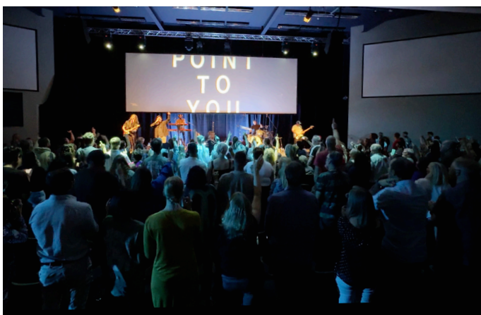
We Are Messengers - World Tour

As we reflect on 2024, we are grateful for the opportunity to serve our community through these events. We look forward to continuing to build relationships, welcome new clients, and find new ways to support the diverse needs of the local community through NewHope Community Centre Events.