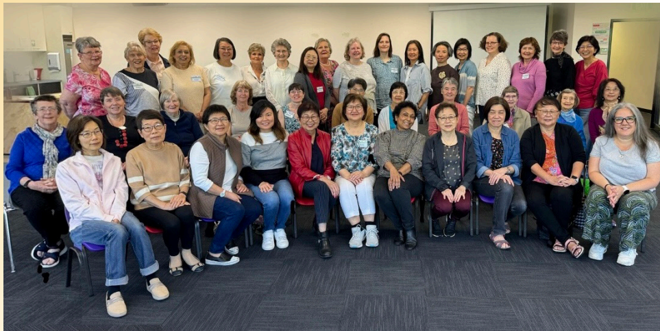
KYB group 2024

Throughout the years, God continues to change & grow the hearts of everyone involved in this group. We delve deeper into God's word each week, and in addition, we also do life together; supporting one another through the ups & downs of daily life, and loving others deeply and unconditionally. We always reflect on how God continues to bless us abundantly more than we could ask or imagine. Therefore, we have been able to live out God's blessing in our lives by being outward focused, offering pastoral care to many.