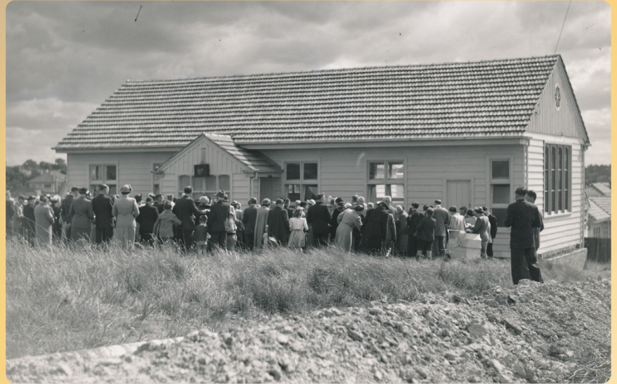
Middleborough Road Baptist Church - Opening