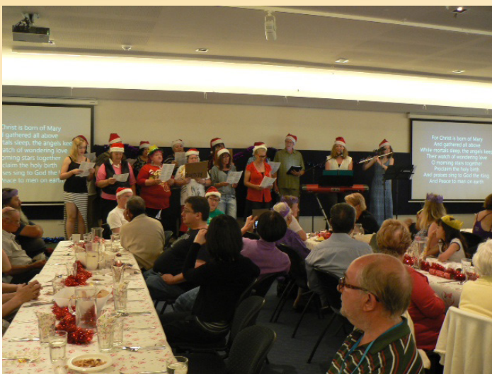
Dinner Tonite Chapel Choir