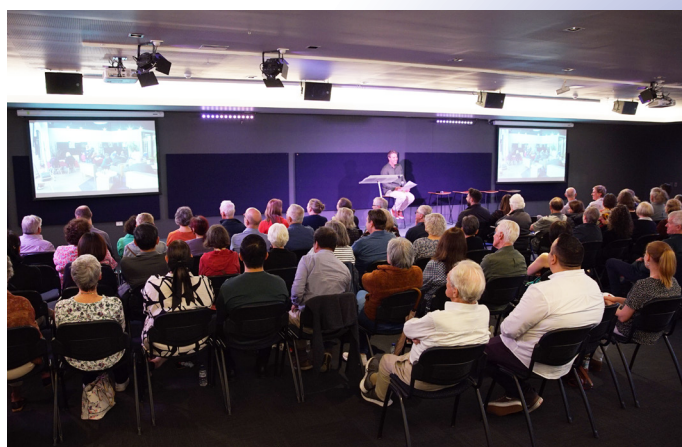
Whitehorse Churches Care - Celebration Night