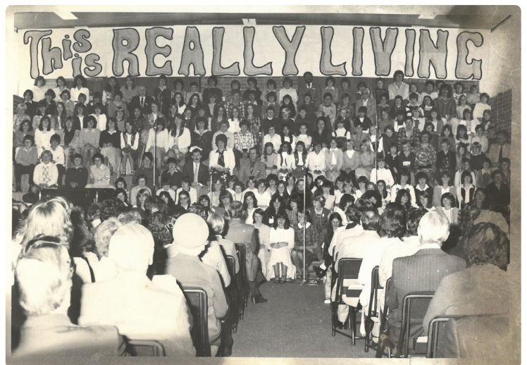
Sunday School Anniversary